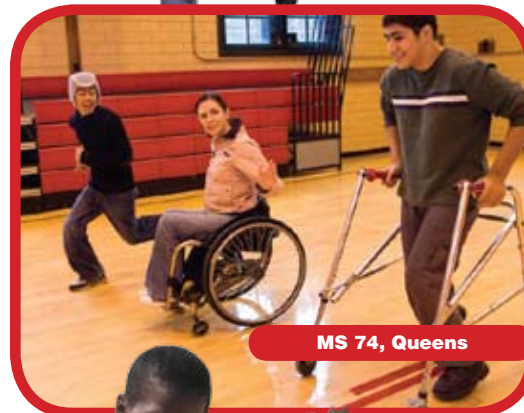
MS 74, Queens