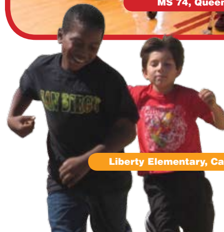
Liberty Elementary, California