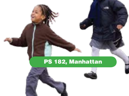
PS 182, Manhattan